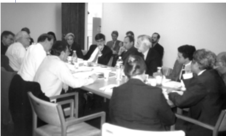
“NPT 2000 Review Follow-up” Strategic Consultation.

Despite the ground-breaking nature of these accomplishments, there was little evidence that these commitments would be worth more than the paper on which they were printed until the meeting of the UN’s