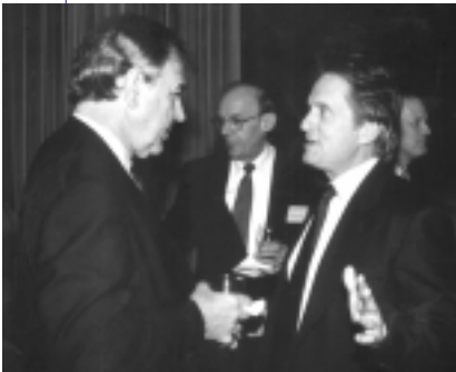
Amb. Richard Butler, Diplomat in Residence, Council on Foreign Relations (left); Actor/Producer Michael Douglas.