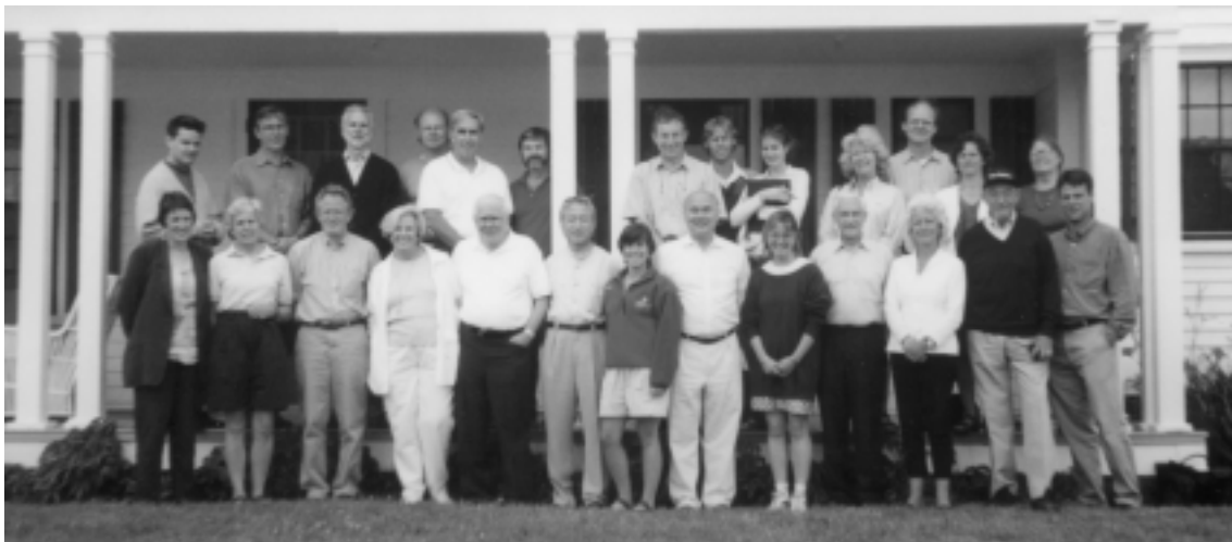
On the porch of the historic "Thinkers' Lodge."