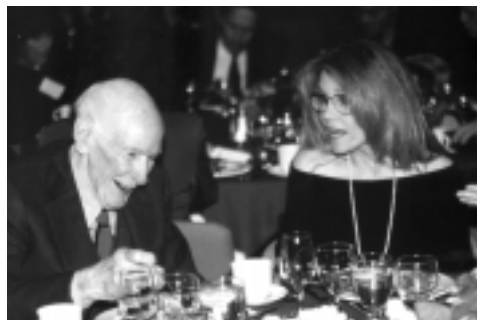
Sen. Alan Cranston; Actress Jane Fonda.