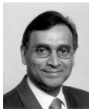
UN Under-Secretary-General for Disarmament Affairs Jayantha Dhanapala.