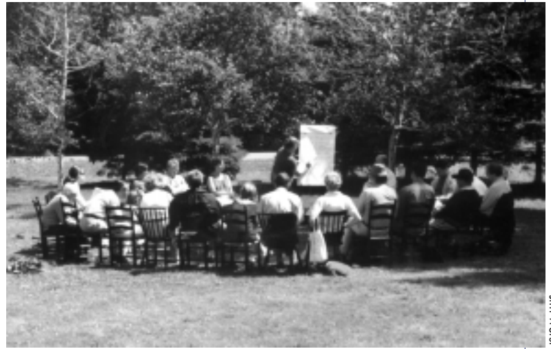
Brainstorming strategies for the next five years.