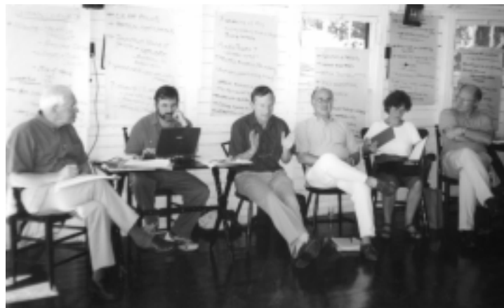
Boiling down a weekend of discussion.

port. A caveat is that the New Agenda is strongest in the countries where NGOs are strong, therefore help may be needed in those countries where this does not apply.